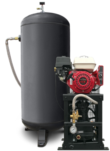
Pictured with optional air storage receiver